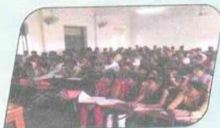
Participation of students in IAS / IPS coaching class