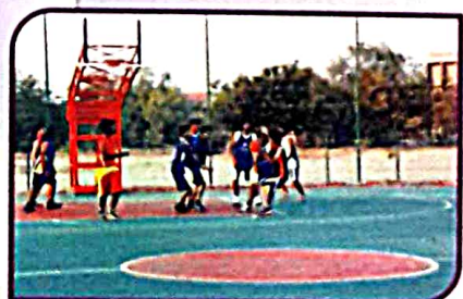
Synthetic Basket Ball Court