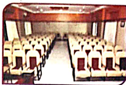
AC Seminar Hall