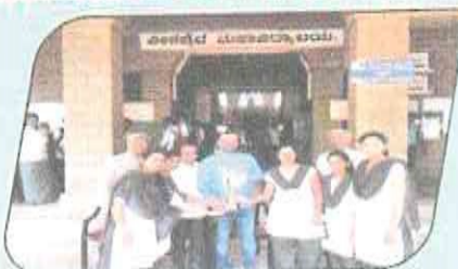
Runners Up of Inter Collegiate Badminton Competition