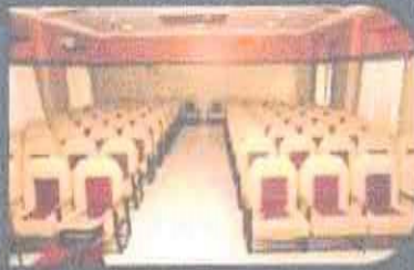
A/C Seminar Hall