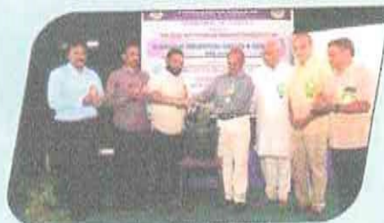
Inauguration of National Conference