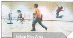
Indoor Play Area