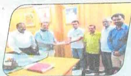
Handing over the cheque of donation to Vijayavani (Flood Victims Fund)