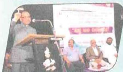
Inaugural Speech by Shri B.C. Biradar, District Principal & Session Court Judge on World Water Day