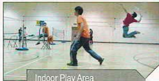
Indoor Play Area