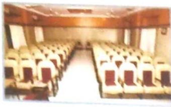
AC Seminar Hall