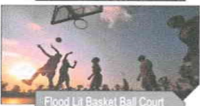
Flood Lit Basket Ball Court