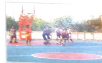
Synthetic Basket Ball Court