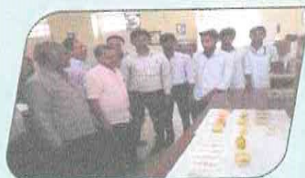
Small products produced in self employment training workshop

"Quality is our Mantra to achieve Excellence"