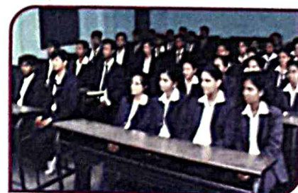
ICT Class Room