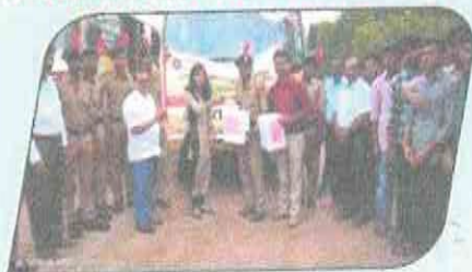
Collection of Donation for the victims of flood in Kodagu