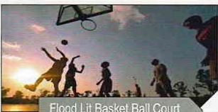
Flood Lit Basket Ball Court