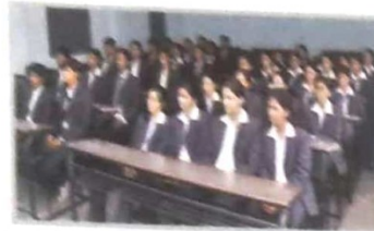
ICT Class Room